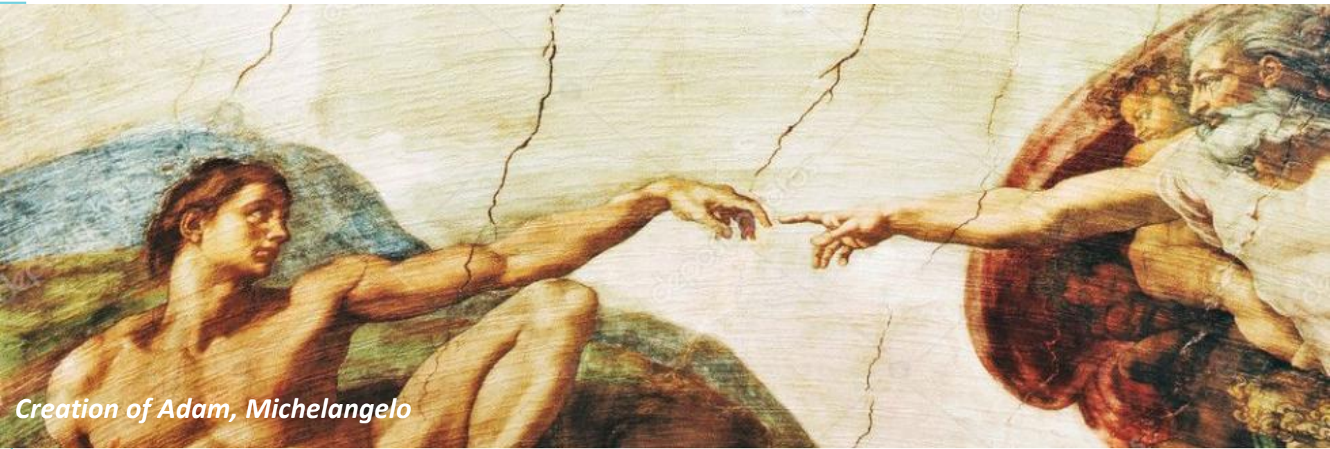
Creation of Adam, Michelangelo

(Personal) leadership is about creating the change you believe in