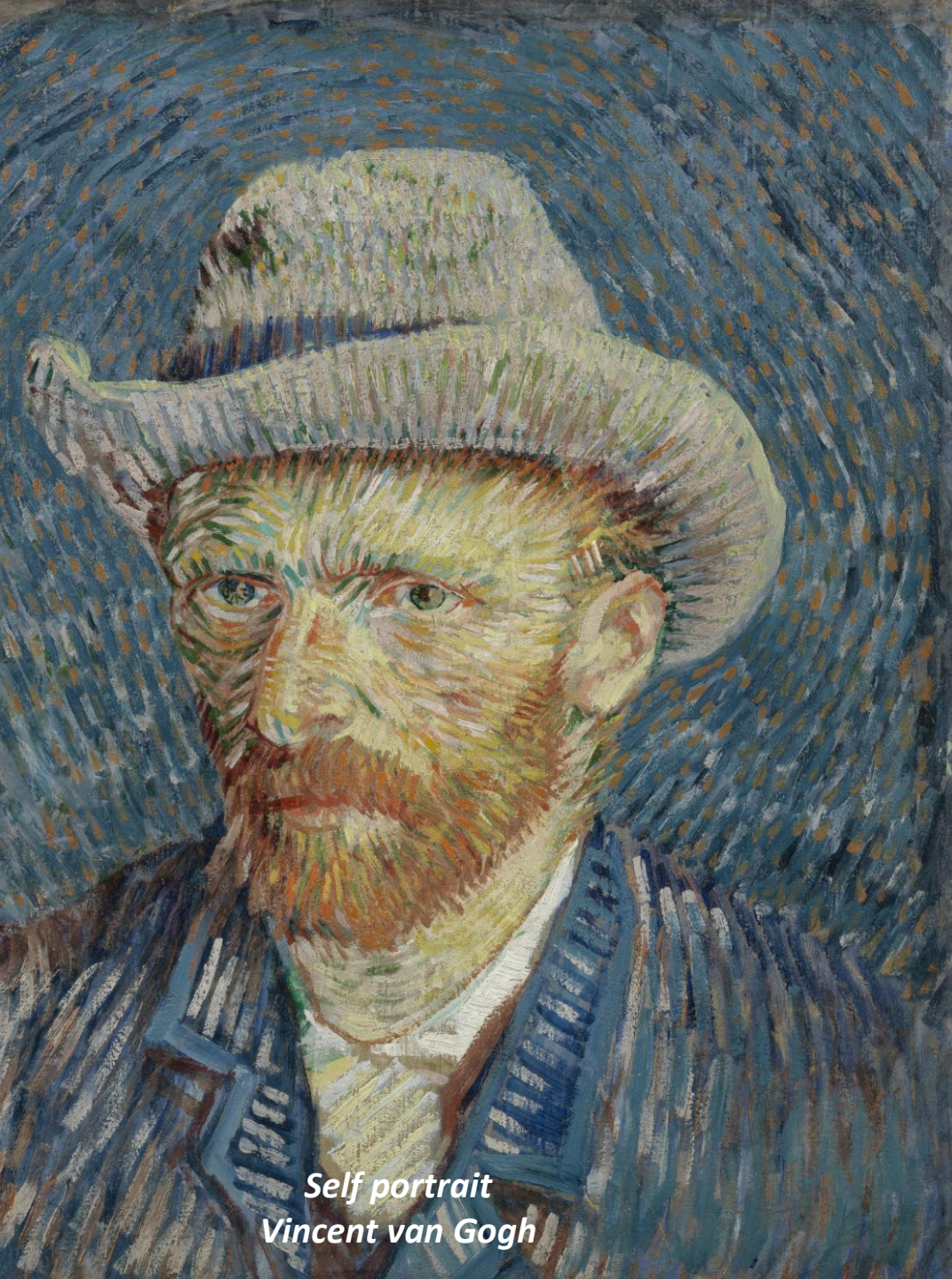
Self portrait Vincent van Gogh